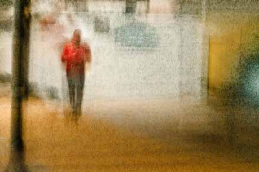
Top: Sandra Gottlieb, October Waves No.26, 2013, one of series of 30 archival digital C-prints, 30" x 40" Above: Sol Hill, 3-urban figure #L1065273-red shirt, 2015, mixed media