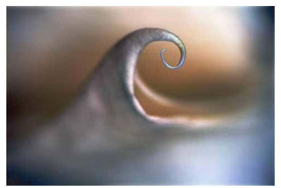
Bert GF Shankman, Hokusai, 2000, pigment print, 20" x 20"

distinctly unearthly, seductive and phantasmagorical.