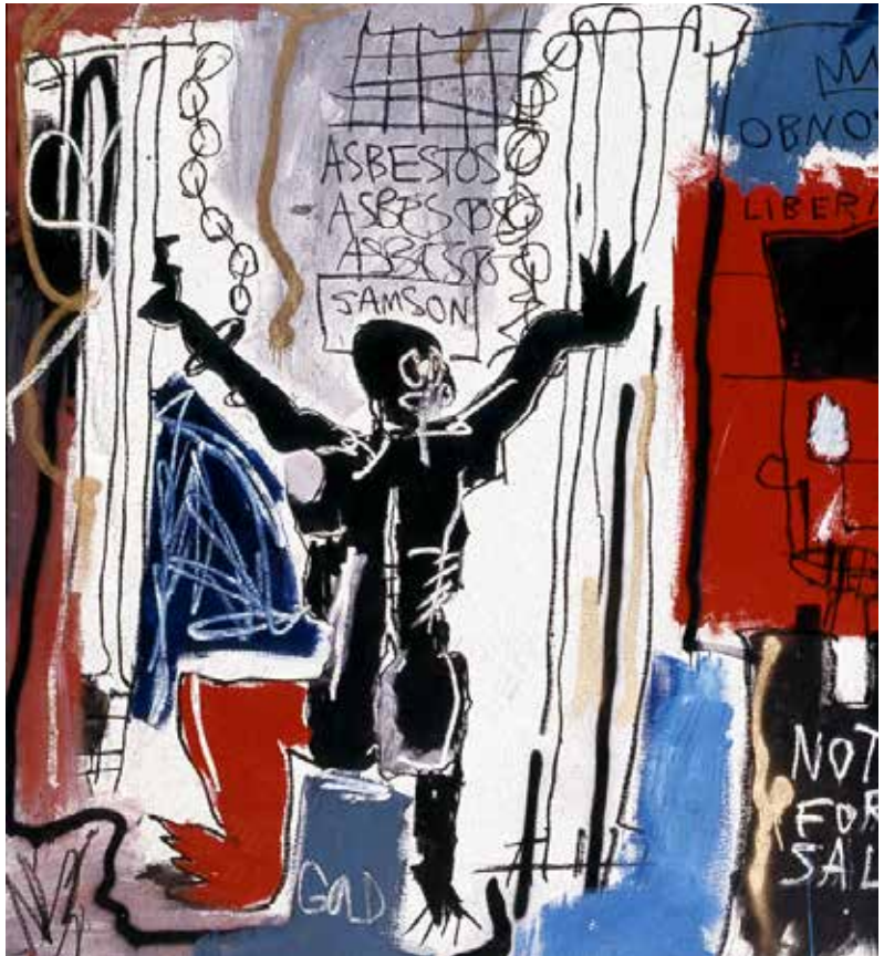
Jean-Michel Basquiat, Obnoxious Liberals , 1982, acrylic, oilstick, and spray paint on canvas, 172.72 x 259.08 cm. The Eli and Edythe L. Broad Collection © Estate of Jean-Michel Basquiat (2014) Licensed by Artestar, New York