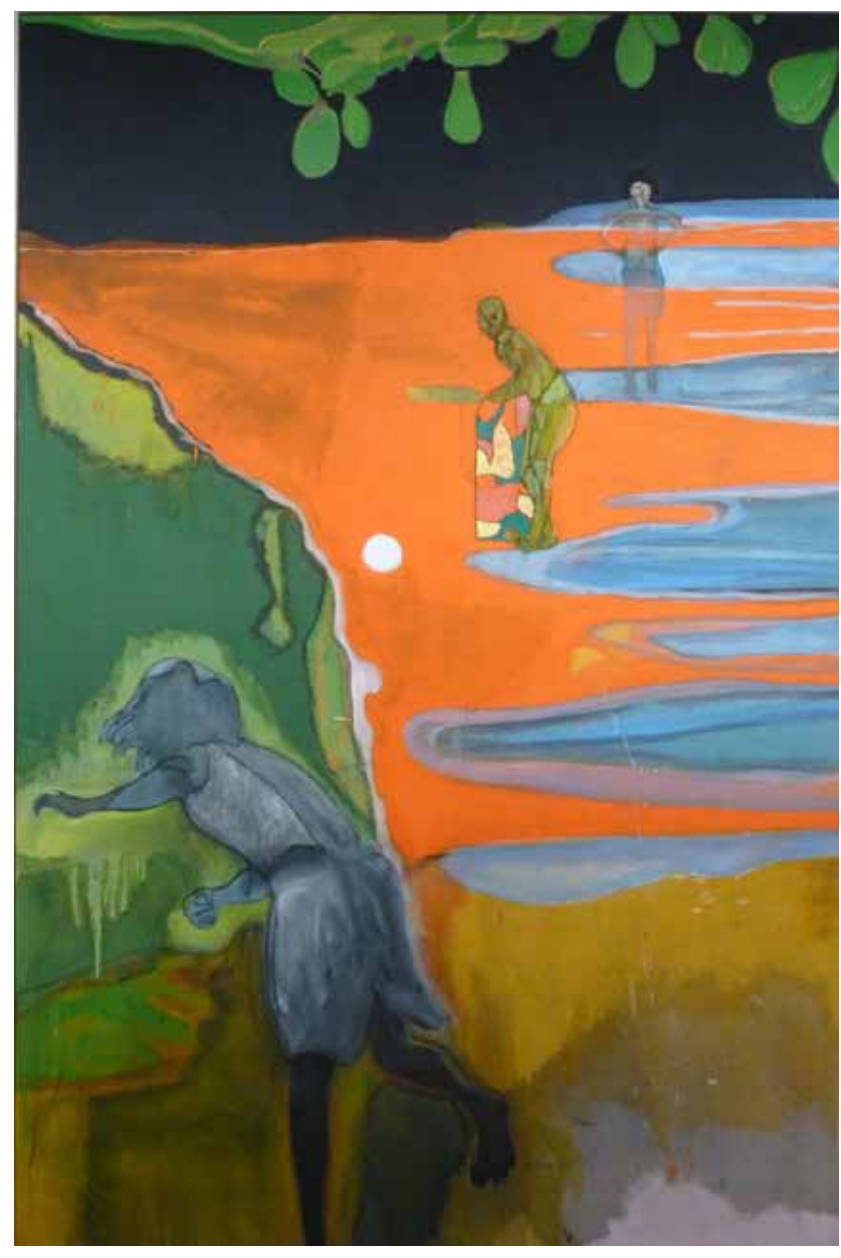
Peter Doig, Cricket Painting (Paragrand), 2006–2012, oil on canvas, 300.4 x 200 cm