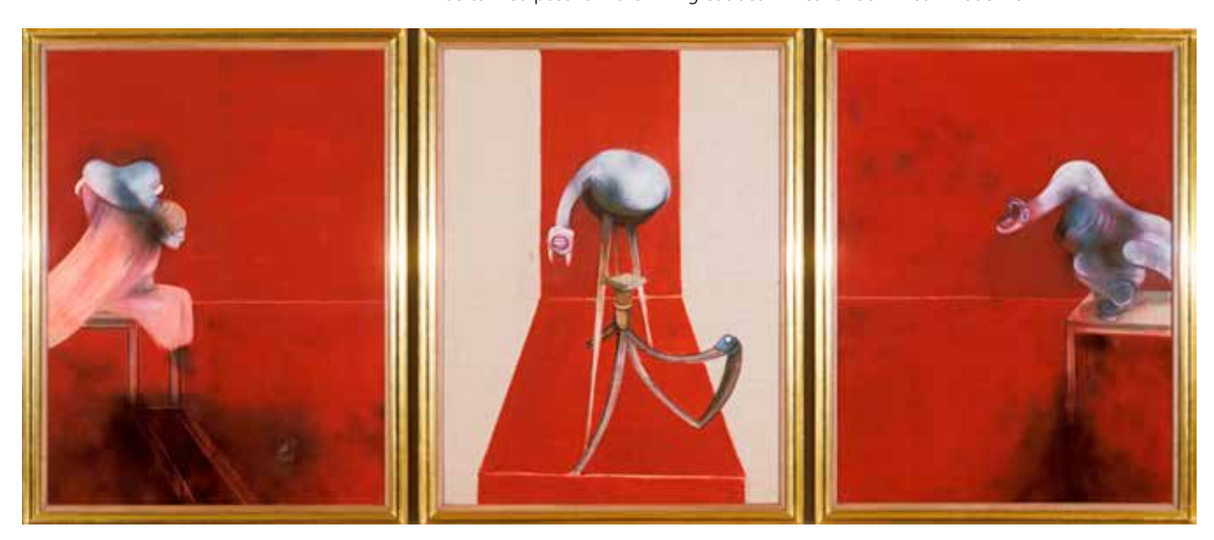
Francis Bacon, Second Version of Triptych 1944, 1988, oil and alkyds on canvas, each panel 198 x 147.5 cm. Tate Modern, London © Estate of Francis Bacon / SODRAC (2013)

of the art of the past half century is the flourished outgrowth of Duchamp's brand of modernism. Rather than post or past, the subsequent influence of his art, viewed in this way, is a logical continuum – still modernism.