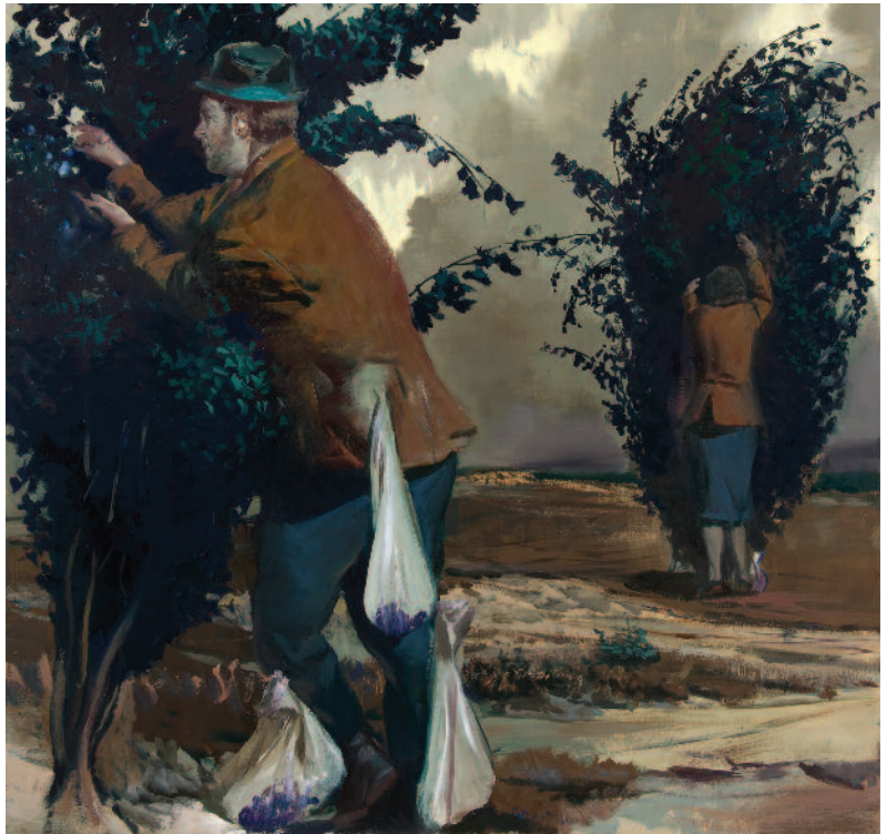
Neo Rauch, Berry Pickers, 2011, oil on canvas, 100 x 120 cm Perlmutter Collection

dART INTERNATIONAL 750A St. Clair Ave. W., Toronto Ontario, Canada M6C 1B5 Tel: 416-651-5778 E-mail: info@dartmagazine.com www.dartmagazine.com