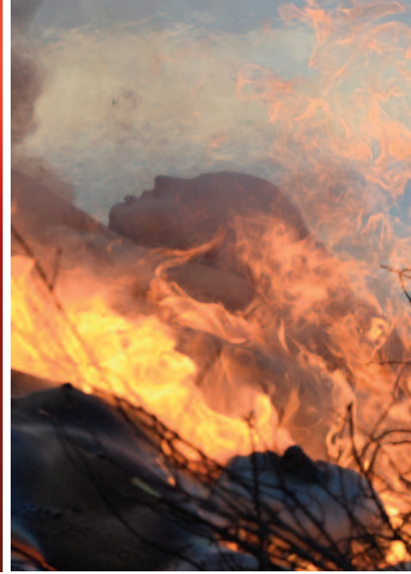
Above: Zhang Yu, Diffused Fingerprints , 2013, behavior, silk, pigment . Installation view at Palazzo Bembo, Venice Biennale, 2013. Photo: Global Art Affairs Foundation Top right: Yoko Ono, Arising , 2013, performance . Photo: Global Art Affairs Foundation