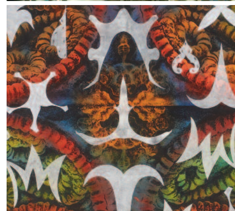
Above: Philip Taaffe, Earth Star I (detail) , 2013, mixed media on canvas, 73-1/2" X 93-1/2" (186.69 X 237.49 cm) . Courtesy of the artist and Luhring Augustine, New York. Middle: Chris Burden, Metropolis II , 2012, installation view