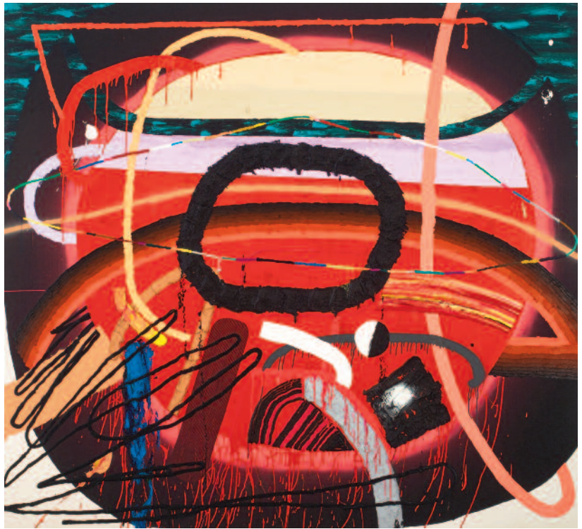
Trudy Benson, Red Giant , 2011, acrylic, flashe, oil enamel, spray paint, and oil on canvas, 96 x 108"