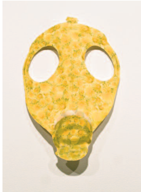
Above: Janet Belotto, Weed of Dreams , 2011, Chromagenic print, perfume essence on Arches paper